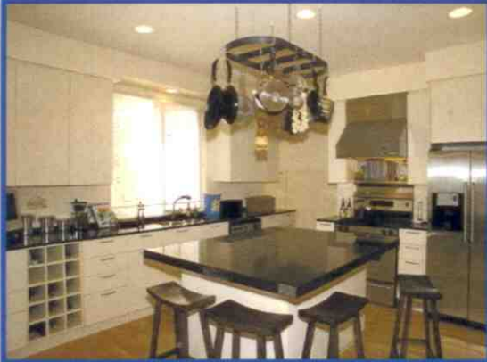
Gourmet Kitchen w/ 8' Glass Pantry

To see this property now, call Kyle @ 303.520.8768