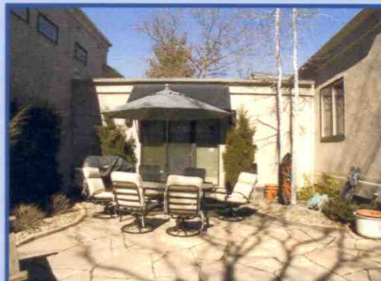
Huge Gated Flagstone Patio w/ Access to Kitchen, Dining Room & Breezeway