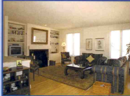
Living Room w/ Gas Fireplace. Built-Ins