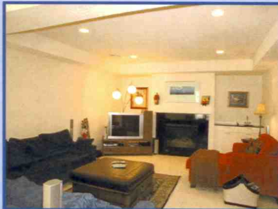
Garden Level Great Room w/ Additional 2 Bedrooms / 2 Bathrooms